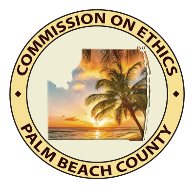
Honesty - Integrity - Character

Palm Beach County Code of Ethics: A Practical Guide